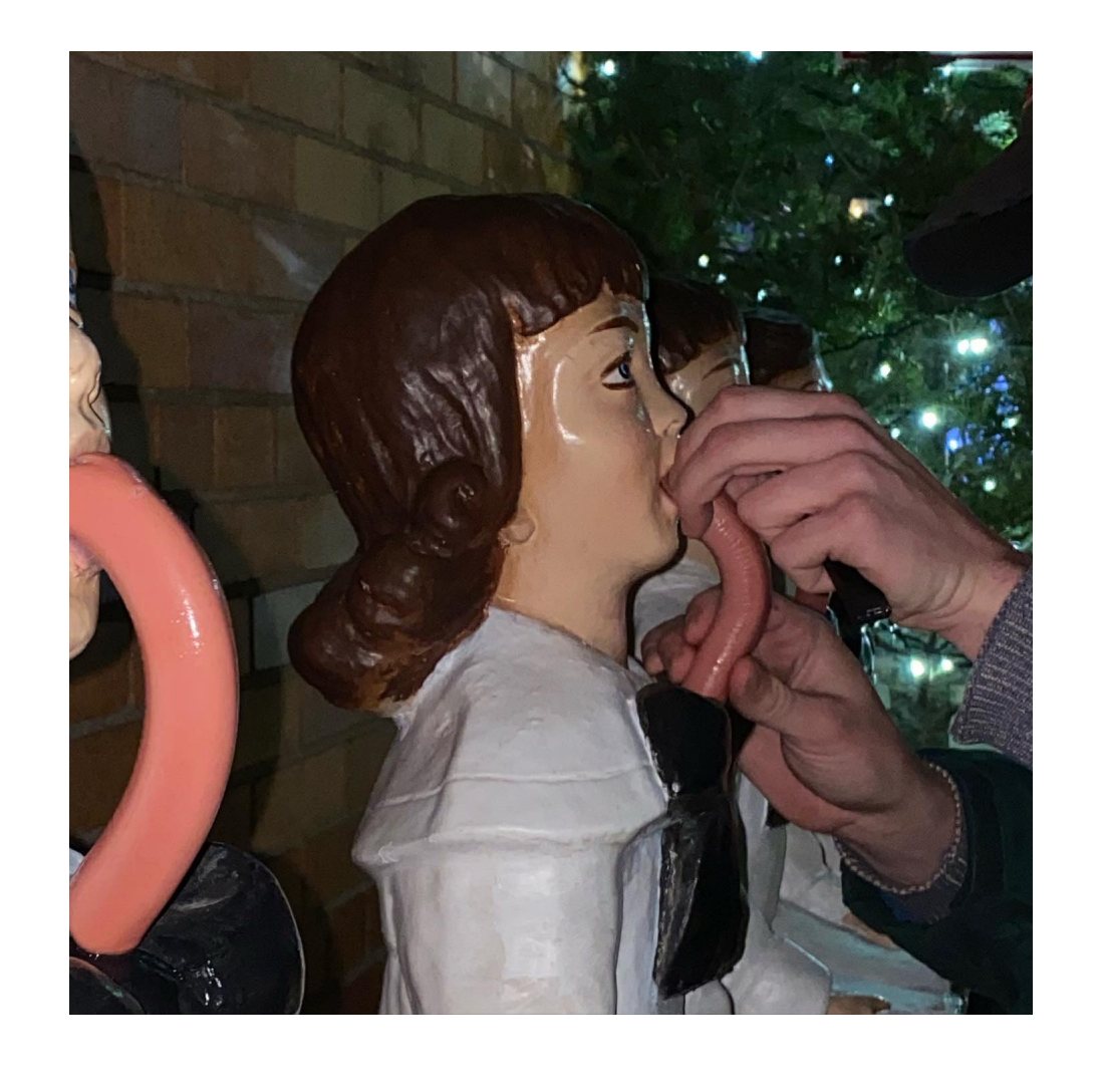
Hotdog holes 12.26.21