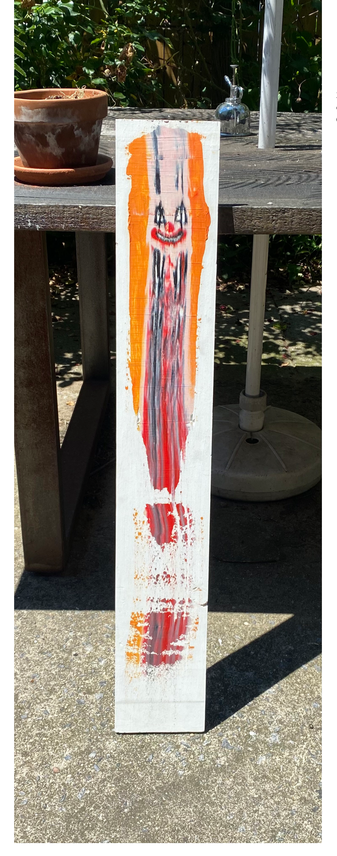
2022 oil paint, wood 6x33 inches